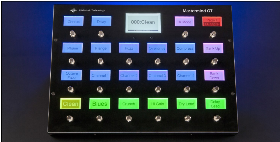
RJM Music Technology's products support professional guitarists around the world. SAI supplies the PCBAs, cable interconnects and chassis assembly on this MIDI controller.